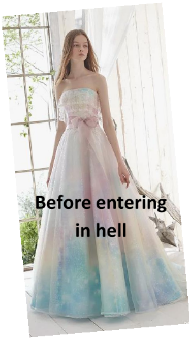
Before entering in hell

decoration is black in palace of hell. Whole black aesthetic with the devil look proper for hell's new queen.